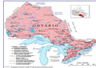
Figure 1. TIBDN Surveillance Area

Statistical Analysis: All data were entered, processed and analyzed using SAS version 9.1 and odds ratios were calculated with 95% confidence intervals. Research ethics board was obtained from all participating hospitals.